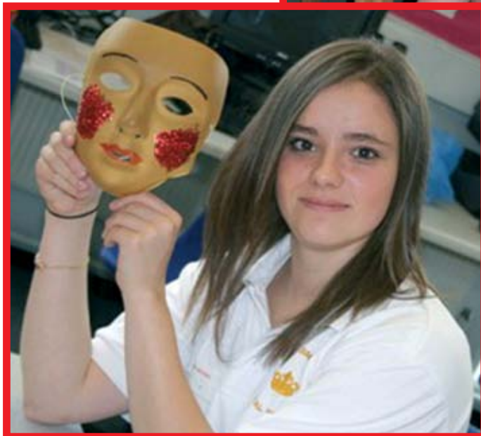
A workshop on our annual Performing & Visual Arts Day.