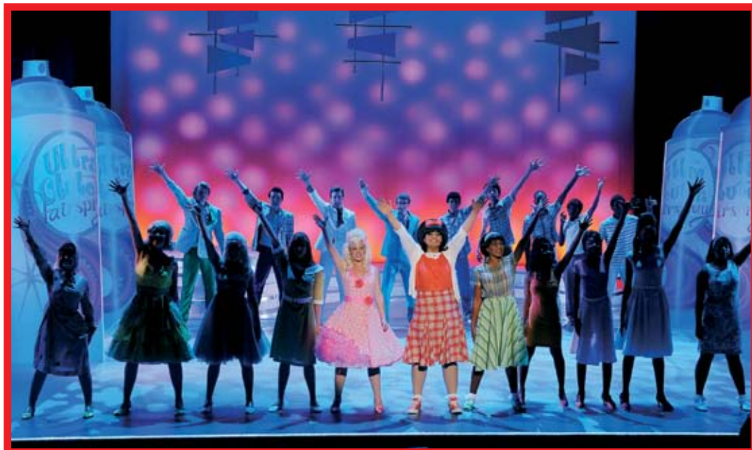
Hairspray - The School Musical, Sky1, September-October 2008.