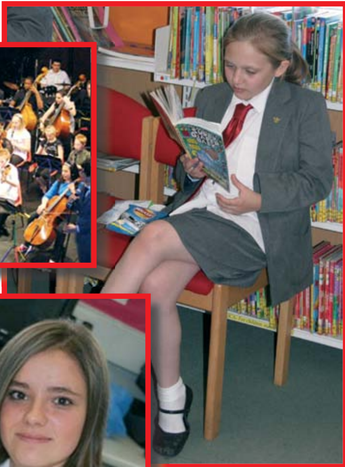
Reading in our library.