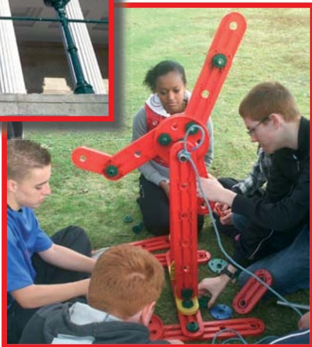
Team building on a 6th form residential weekend.

Sixth Formers are encouraged to take an active role in the school community and beyond. They act as mentors to younger students, take part in numerous extra curriculum activities and support charitable and community projects. Participating in enrichment activities broadens their horizons, helps them develop new and varied skills and become socially and politically aware young adults.